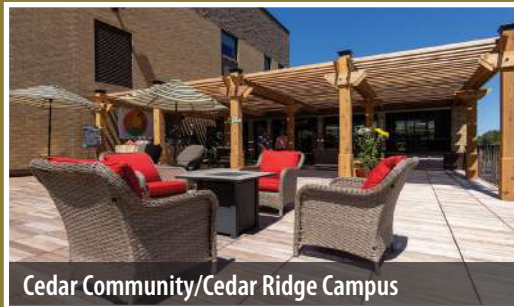
Cedar Community/Cedar Ridge Campus