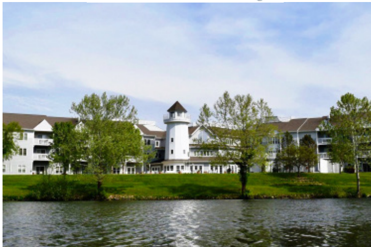
St. Louis, Missouri