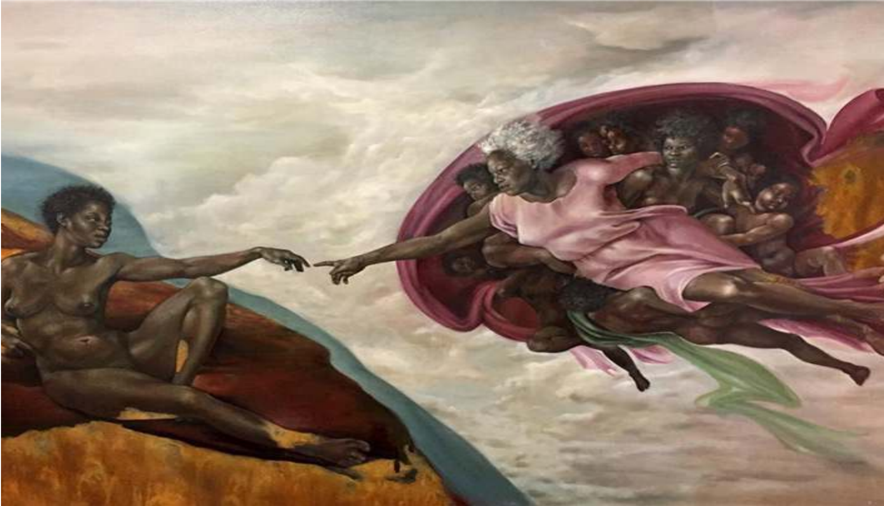
The Creation of God by Harmonia Rosales