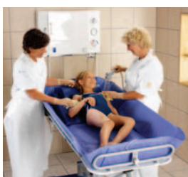
Concerto Shower Trolley