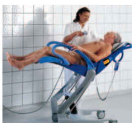
Carendo Shower & Hygiene Chair