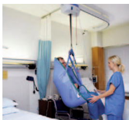
Maxi Sky600 Ceiling Lift