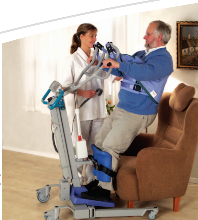
Sara 3000 Standing & Raising Aid

SOLE SOURCE CONTRACT FOR LIFTING & HYGIENE