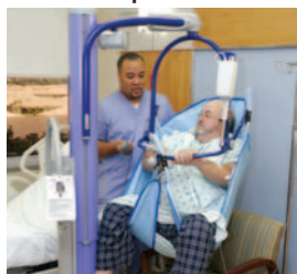
Maxi Move Lift