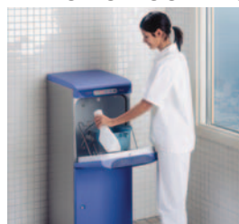
Ninjo Flusher Disinfectant